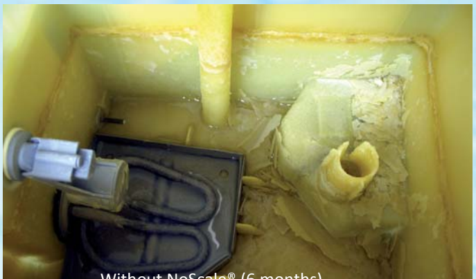
Without NoScale<sup>®</sup> (6 months)

NoScale® conditioner systems for chlorinated, municipally treated water supplies.